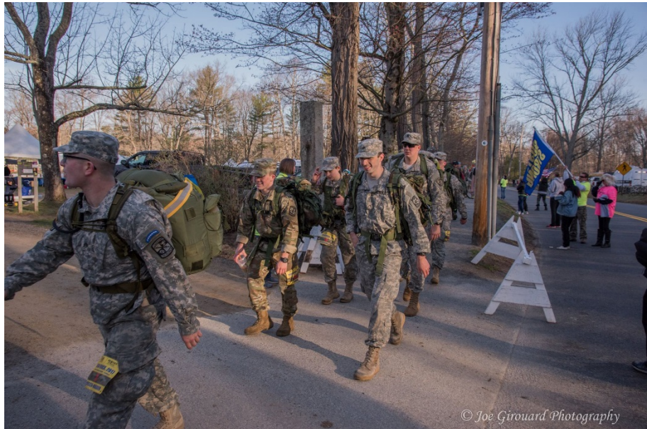
Several Paul Revere Battalion Cadets as they fight through the Tough Ruck.

In terms of what to pack and what to wear while rucking, we suggested packing an extra pair of thick rucking socks, foot powder, body glide, mole skin and candy which had dual purposes for energy and moral boost. Another thing that should be done in preparation is gathering names of individuals who made the ultimate sacrifices for the country. It is common practice to wear the names of fallen service members on the ruck as