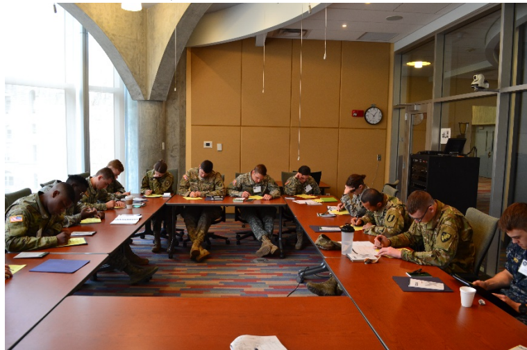
A classroom of Cadets participating in a negotiation.

It was a fantastic experience, and one that I would definitely recommend to others. I was able to meet and bond with people from different schools, meet some of the Cadets at West Point who graciously housed me for the weekend, and learn about the many programs that work to develop the Army's future leaders. I became more aware of how I speak and carry myself in front of others while learning to work with my peers on how to overcome barriers like cultural differences to achieve common goals from seemingly diverse interests. Through this, I was not only able to learn about better forms of communication, but I was able to better myself as a leader and as a representative of the US Army.