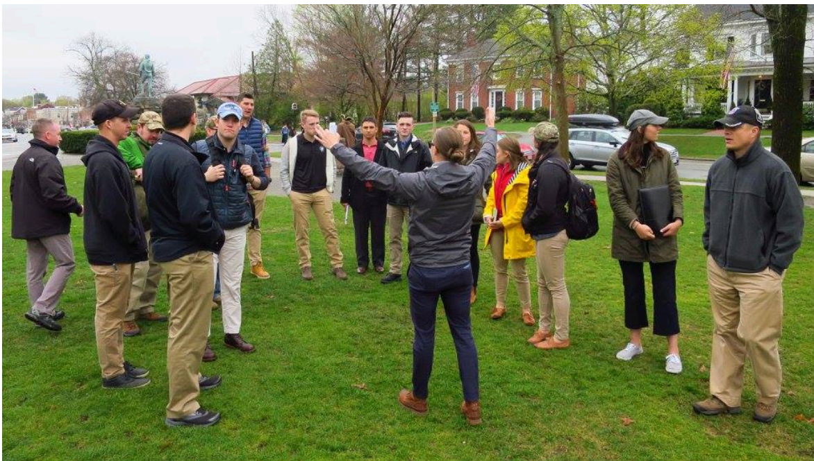
Members of the MSIV class and Paul Revere Battalion Cadre on the Lexington Green discussing the battle.

Through exploring the battle sites in Lexington and Concord Cadets not only analyzed the specific lessons derived from studying the leaders, mission command and operations process involved in the Battle of Lexington and Concord. Cadets also gained a new appreciation for history's applicability and lessons for the modern officer.