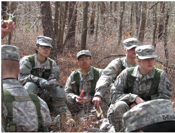
Cadets taking a break from the action while listening to an After Action Review

We completed five platoon rotations on Saturday and Sunday that focused on small unit tactics. Each rotation involved a new mission, planning and execution time, and an after action review. The MSIII's directed all operations and we had a great experience.