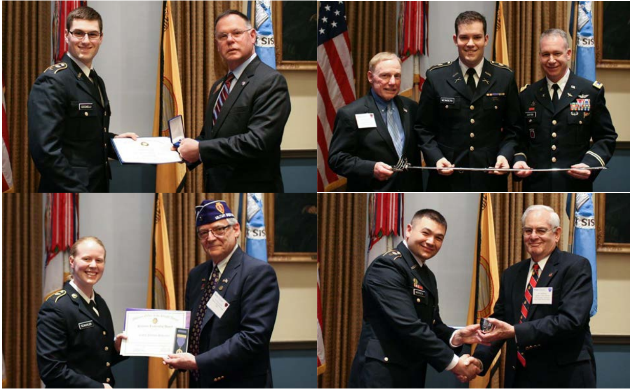
Some of the Cadets honored with awards by outside organizations. Over half of the Cadets of Paul Revere Battalion were presented with awards.