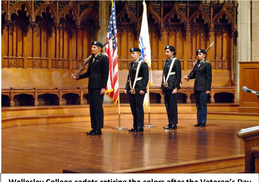
Wellesley College cadets retiring the colors after the Veteran's Day Ceremony.

Day offers us an opportunity to reflect on them and the sacrifices they have made. The history and the ongoing war that our predecessors have passed onto our shoulders is a heavy weight to