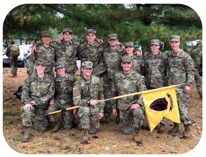
The Ranger Challenge Team after completing a 6-mile ruck on the final day of the competition.

alternates at any given moment due to the high injury rate at the competition. Additionally, there must be a cadet from every class year and two females minimum.