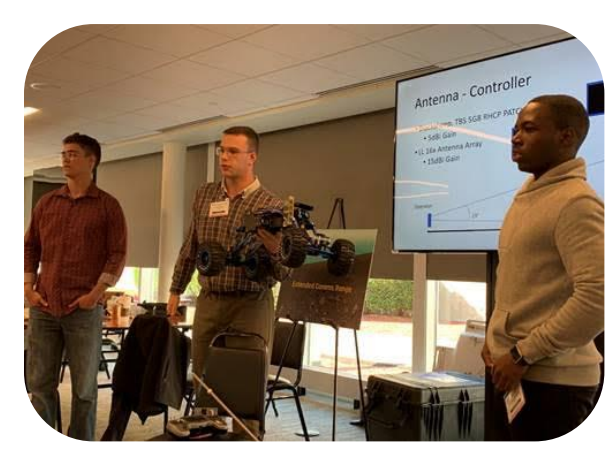
Cadets present on Extending Signal Transmission

Nightcrawler, an unmanned ground-vehicle built to clear rooms by collecting and distributing visual intelligence from inside buildings. Currently, the Nightcrawler "program" is being used by select SOF units and still very much in a rapid iterative stage of development. One specific SOF unit was the organizing force behind this Hackathon. This specific unit wanted to see what improvements to the Nightcrawler we could make in 2 days. Teams were composed of 4-5 cadets with varying academic interests and skills along with 2-3 Lincoln Labs staffers who could provide some technical guidance if necessary. Each team was tasked with one specific problem associated with the Nightcrawler. The 4 problems we worked on were: