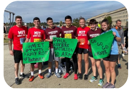
The team posing with signs from CDT Butler's family in front of the Pentagon, post-race.

Aided by near-perfect running conditions, our team excelled, with several members setting personal bests and blowing past their pre-race expectations.