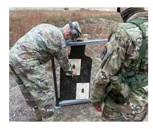
MSG Jordan dropping knowledge