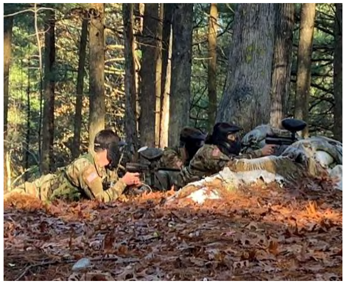
MEGALAB 3 Offensive Operations Paintball