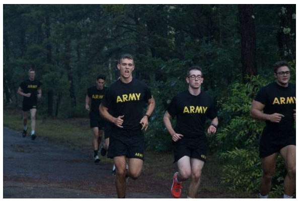
OPERATION AGILE LEADER