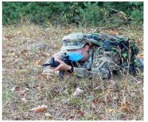
MEGALAB 1 Land Navigation and Movement Techniques