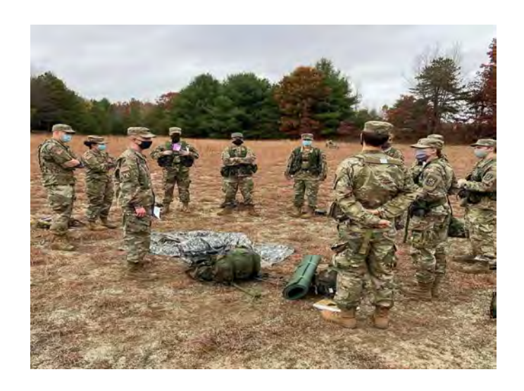
<u>MEGALAB 2</u> Marksmanship and Fieldcraft