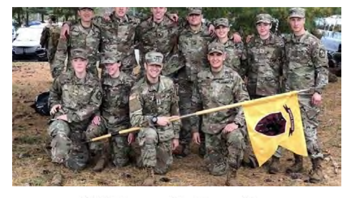
2019 Ranger Challenge Team... 2020 Team Coming Soon!

Unfortunately, this year the competition was postponed to the spring due to the COVID-19 pandemic. However, this has not stopped those participating in Ranger Challenge from developing their skills and teamwork. In my opinion, the rescheduling of the event only gives us more time to train and create the most prepared Ranger Challenge team to ever come out of the Paul Revere Battalion. The team has gained the interest of more prospective members than in past years due to their being more time allowed for recruiting efforts. Zoom calls have been utilized to strengthen the understanding of the intellectual nuances of each event. The team was even fortunate enough to have a call with a member of the Army Special Forces for a personalized advanced land navigation class that focused on unconventional techniques that can be used during the challenging land navigation event.