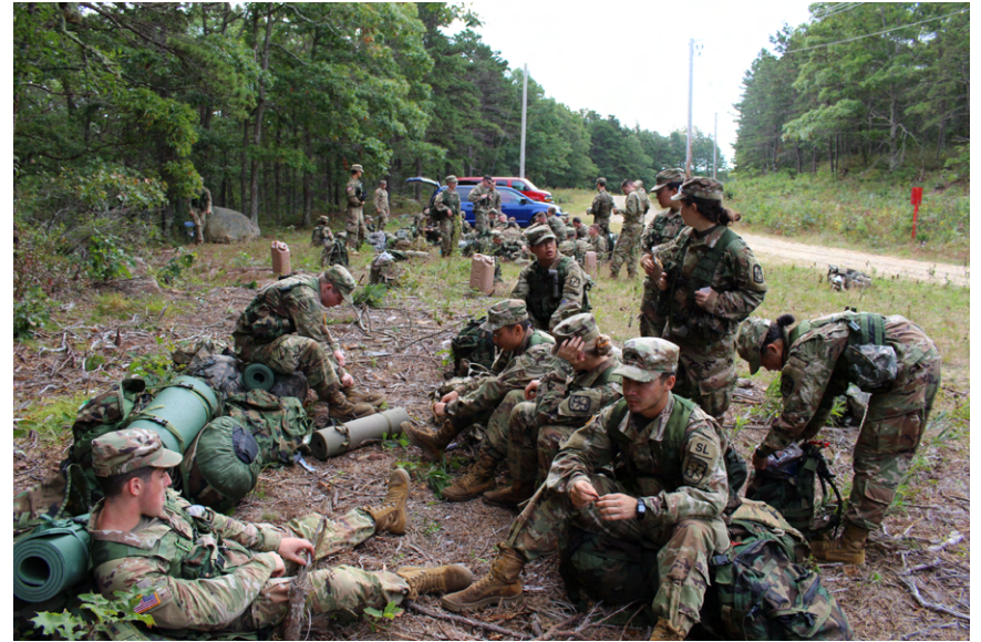
Cadets taking a break before embarking on their next mission.