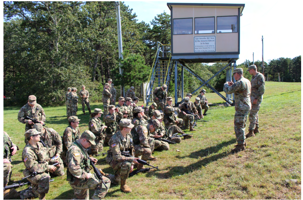
Cadets receiving some key preliminary marksmanship instruction (PMI) from instructors.