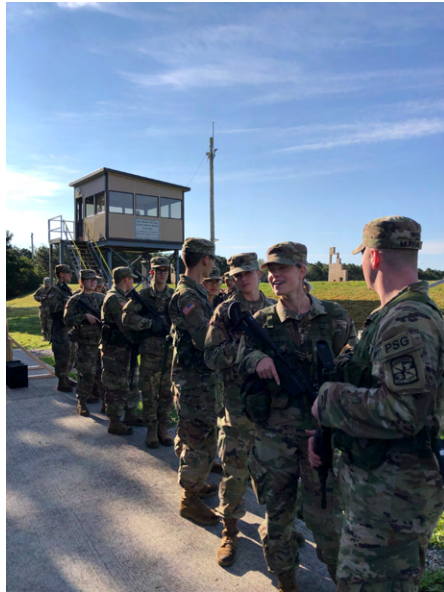
Cadets preparing for a day on the range.