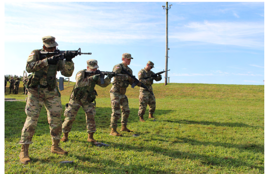
Cadets practicing before hitting the range.