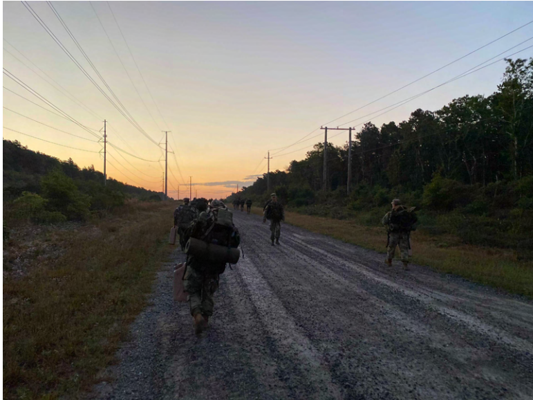
Rucking with the sunrise.