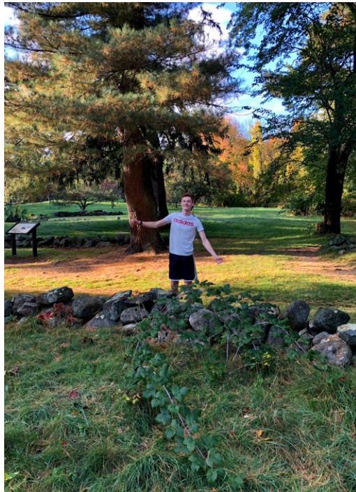
CDT White (Tufts '25) enjoying some nice fall weather.