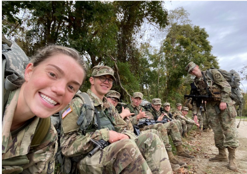
Cadets relishing a welcome break before another afternoon of competition.

Looking forward to next year, I have even higher hopes for the team as the team passes into the hands of the very high-speed freshmen and sophomores who have already begun reaching out to me with specific training ideas for improving our odds at the competition. From a land navigation class by a champion orienteering racer to 3D printed weapons for assembly practice—the will is there, we'll just need to follow through a year from now.