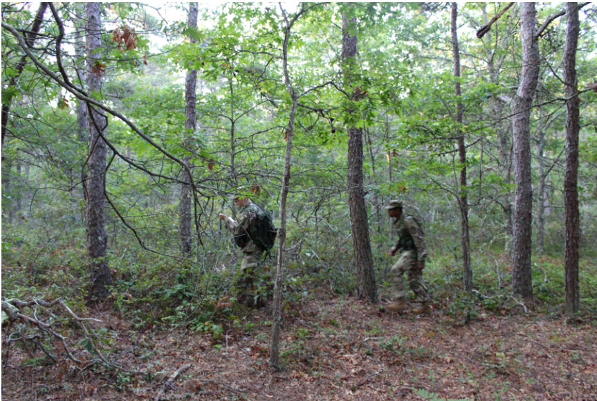
Land navigation- the bane of many a cadet.