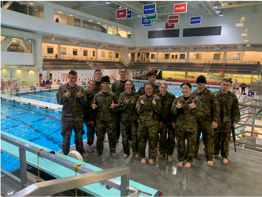
Cadets after surviving the Combat Water Survival Test (CWST).