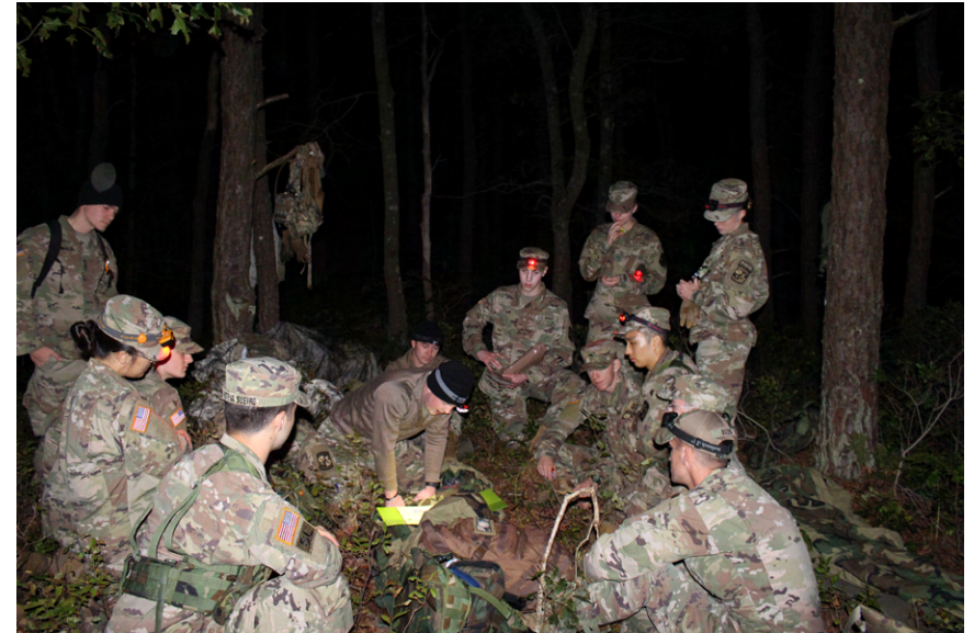
Cadets planning to defend the good citizens of Atropia against the invading Arianans.